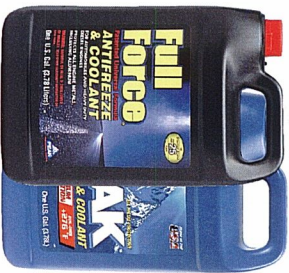
Full Force®/PEAK® Antifreeze & Coolant