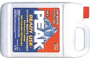
PEAK® Ready Use Antifreeze & Coolant