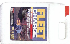
Fleet Charge® Fully Formulated Coolant (SCA Pre-Charged)