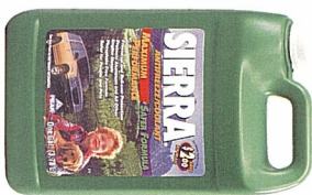
Sierra® Antifreeze & Coolant