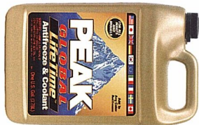
PEAK® GLOBAL Lifetime™ Antifreeze & Coolant